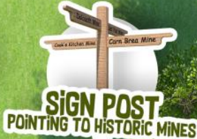
SIGN POST POINTING TO HISTORIC MINES