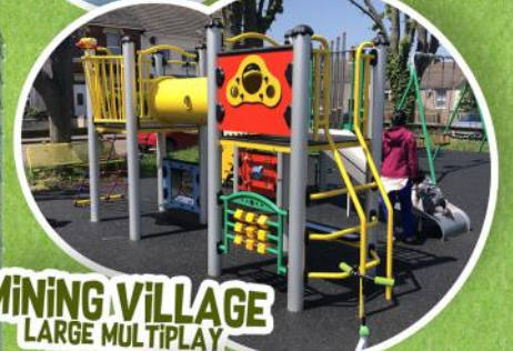
MINING VILLAGE LARGE MULTIPLAY