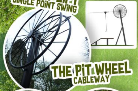
THE PIT WHEEL CABLEWAY