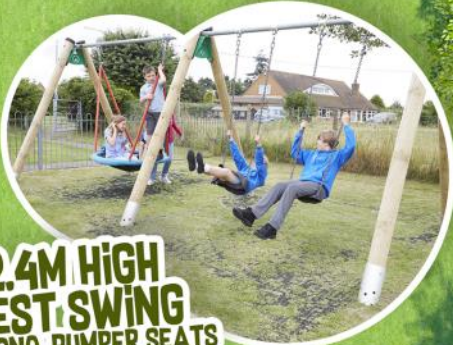
2.4M HIGH NEST SWING WITH 2ND. BUMPER SEATS