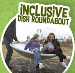
INCLUSIVE DISH ROUNDABOUT