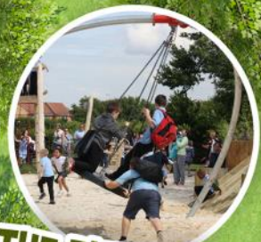
THE PIT LIFT SINGLE POINT SWING