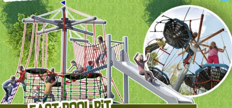
EAST POOL PIT BIRDS NEST TREE WITH BRIDGE & SLIDE