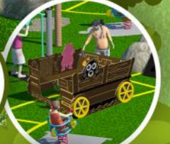
MINING CART GAMES/ACTIVITIES