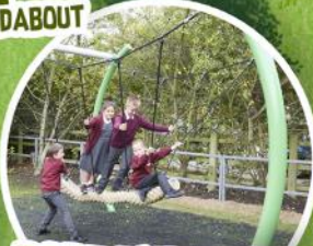
ROPE END SWING