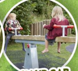
HAND CAR 4 SEAT SEESAW