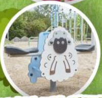
SHIRLEY SHEEP SEE-SAW