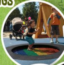
MINE SHAFT COLOURFUL TRAMPOLINE