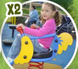
X2 CANARY SPRING INCLUSIVE