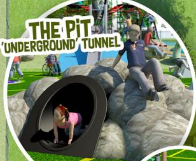
THE PIT 'UNDERGROUND' TUNNEL