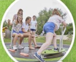
TURNTABLE INCLUSIVE SCOOTER ROUNDABOUT