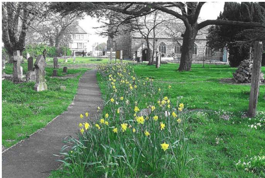
South West in Bloom Award Winner Camborne Churchyard